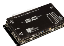
P/N FlashRunner Programmer