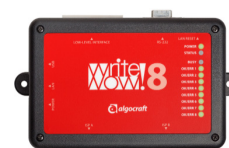
P/N WriteNow Programmer