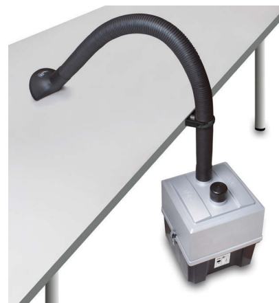
> Zero Smog EL unit